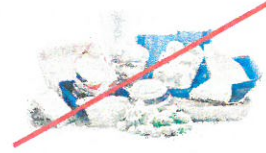
NO Foam Cups & Containers (Check Earth911.org for options.)