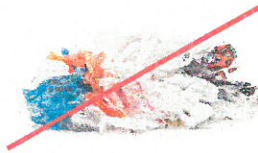
NO Plastic Bags & Film (Find a recycling site at plasticfilmrecycling.org)