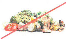
NO Food Waste (Compost instead!)