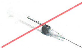
NO Needles (Keep medical waste out of recycling. Place in safe disposal containers like Waste Management's MedWaste Tracker® box.)

To Learn More Visit: RecycleOftenRecycleRight.com